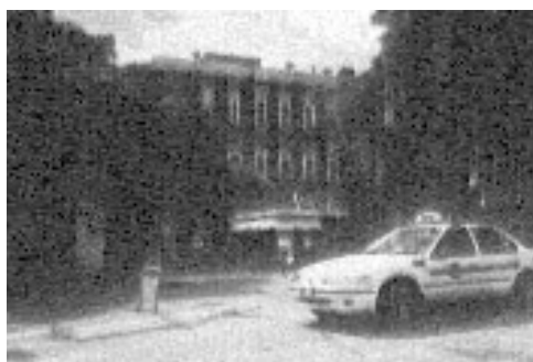
Royal Prince Alfred Hospital, located on the opposite of the street.

During these 3 month-course, there were good opportunities to have a special visit to the Reactor 'HIFAR' # (ANSTO, Lucas Height), the National Medical Cyclotron (ANSTO, Camperdown) and PET Unit (Royal Prince Alfred Hospital, RPAH, Camperdown). The ^{18}\text{F} -FDG from the National Medical Cyclotron is transported through the underground tube to the PET Unit, RPAH which is located on the opposite side of the street.