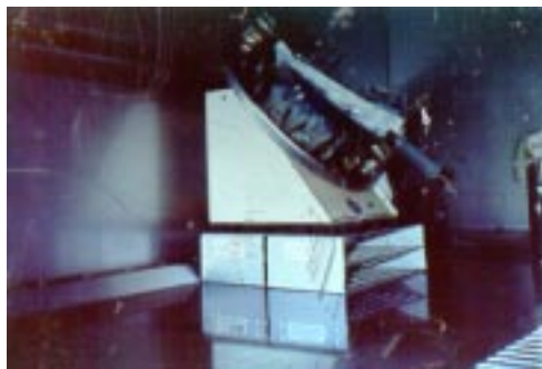
Rotation of white blood cells labelled with ^{99\text{m}}\text{Tc} -colloid, done in a sterile cabinet class II.

It is a common tool to detect infection. In Westmead Hospital, Liverpool Health Service, and some other places, the pharma-