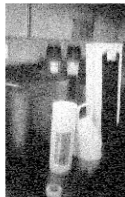
^{18}\text{F} -FDG, Nuclear Medicine, RPAH.