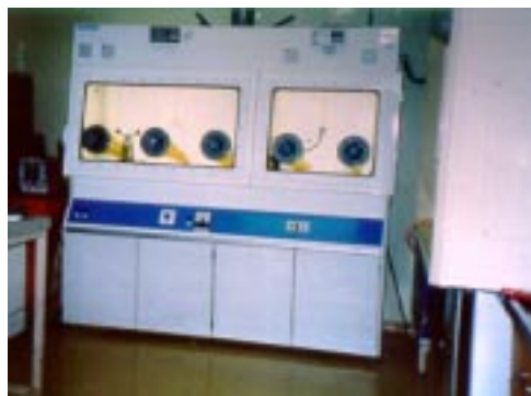
A sterile cabinet class III in a room with filtered air coming in.

production of ^{99m}\text{Tc} -generator and some in-house pharmaceuticals were observed first hand.