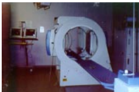
A Co-PET at Liverpool Health Service.