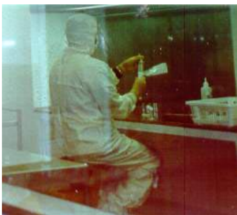
Production of pharmaceuticals in a clean room.

This is aseptically performed in a clean environment to meet GMP (Good Manufacturing Practice) standards for the manufacture of sterile medicinal goods. Monitoring of the environment, equipment and operators are carried out before and after each production run. Operators carrying out these tasks are required to wear special, sterile and clean garments, if they use a clean room. Alternatively, a sterile cabinet class III, which needs to be fumigated periodically, can be used effectively. The