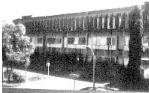
Nuclear Medicine, Westmead Hospital.