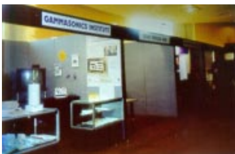
Booths at the Annual Scientific Meeting held by the ANZSNM in Perth.