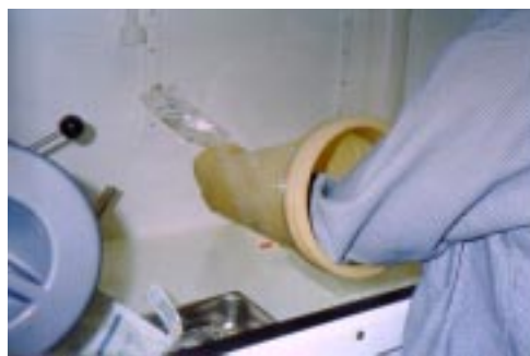
Either dispensing or splitting of pharmaceuticals is done in a sterile cabinet class III or in a clean room.

Three pharmaceuticals that cannot be produced as in-house kits according to the Registration Law are MAG 3 (Mallinckrodt), Ceretec (Amersham), and MIBI (Dupont). In this case, one vial of the drug will be reconstituted and then split into 5 fractions in a sterile cabinet class III or in a clean room.