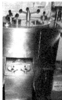
A stainless steel container with the hydrolic system for keeping various labelled compounds separately.

Other experiences fell on the observation of activities in a hot laboratory, iodination using ^{123}\text{I} or ^{131}\text{I} , ^{14}\text{C} -urea breath test, and