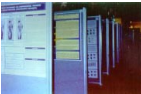
Poster presentation at the Annual Scientific Meeting held by ANZSNM in Perth.

It was recognised that the systematic and well-planned work system has been established in every institute to reach the same and international standards. The laboratories are well-equipped with adequate facilities. Good documentation systems (for protocols, results, etc.) have also been introduced. In addition, their staffs are properly educated, experienced, and helpful. Thus, it is not exaggerated to say that the 3 month-training course on Radiopharmaceuticals in Sydney provides valuable and fruitful knowledge and experience.