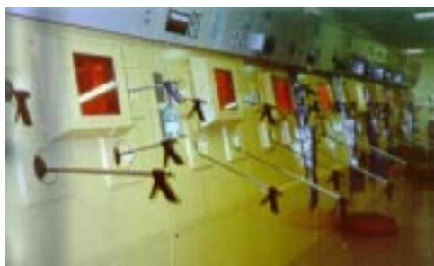
The production cells at the National Medical Cyclotron, Camperdown.

determination of red blood cell volume/ plasma volume/ total blood volume using ^{51}\text{Cr} , and Co-PET imaging using ^{18}\text{F} -FDG. The Educational Programme is held regularly - every week at Westmead and every fortnight period at Liverpool. Their staff or a guest speaker will present a talk on a medical/ scientific topic.