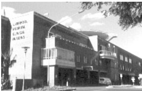
Nuclear Medicine, Liverpool Health Service.