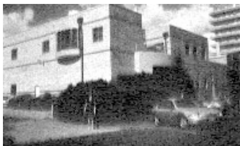
The National Medical Cyclotron Building, Camperdown.