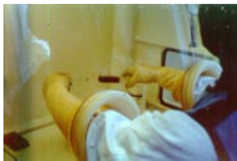
Nearly every step in the white blood cell labelling technique including centrifugation is done in a sterile cabinet.

ceuticals is produced in-house. Usually, the labelling will be carried out with great care and aseptic techniques in a sterile cabinet class II or III.