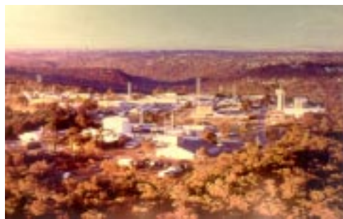
ANSTO, Lucas Height

investigation done in animals, and clinical study in patients. The production of medical products has been standardised in the same pattern of European countries including U.K., and Nordic Group (Denmark, Finland, Iceland, Norway, and Sweden).